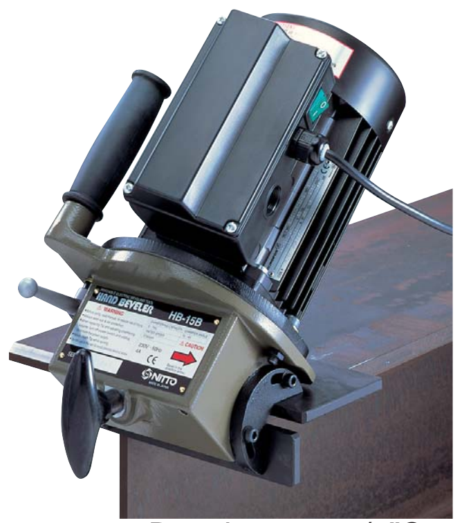
Bevels up to 5/8"C