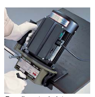
Beveling steel plates